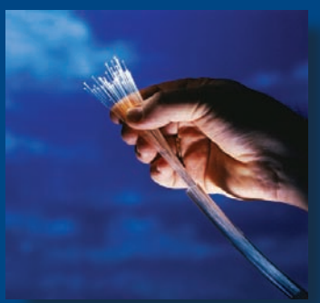
Utilities and Communications

Today, rural America is creating new economies able to compete in global markets by employing digital connectivity, developing new technologies, and harnessing ingenuity. It is advancing new sources of renewable energy through the utilization of America's natural resources and bringing greater quality of life to areas where enhanced education and health care services previously didn't exist.